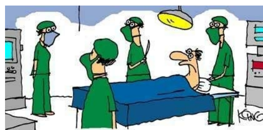
"Nurse, get on the internet, go to SURGERY.COM, scroll down and click on the 'Are you totally lost?' icon."

On TV, I saw a very brief but interesting item on a Royal Navy helicopter display team. They were